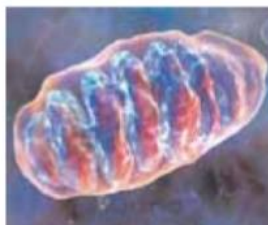
MITOCHONDRIA; THE BODY'S CELLULAR POWERPLANT

Acidity or alkalinity of our internal fluids has a profound effect even at the individual cellular level