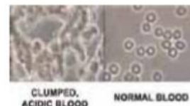
CLUMPED, ACIDIC BLOOD NORMAL BLOOD

They witness a repetitive pattern unfolding that has prompted them to state that the over-acidification of the body, caused by improper eating and living, causes a proliferation of antagonistic microforms which debilitates the body and, if not corrected, may ultimately cause our demise.