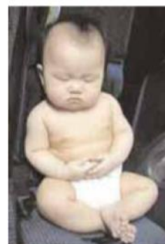
MEDITATION IS ALKALISING. START EARLY

You can also understand from this that our blood pH can be affected at any time of the day by a myriad of events; food, drink, stress, pollution, exercise, or beneficially, by meditation, by drinking alkaline water, by deep breathing, even by being happy